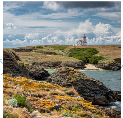
Pointe des Poulains