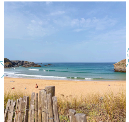
Plage de Donnant