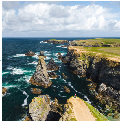
Les Aiguilles de Port Coton